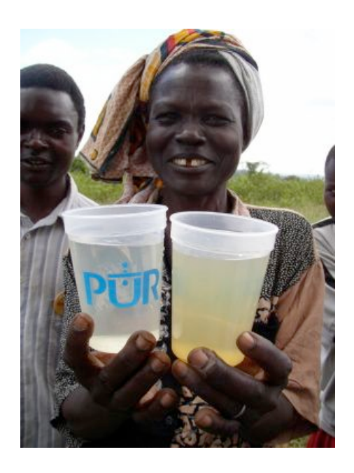
Turbid water in Kenya treated with PUR (P&G, G. Allgood)

Each sachet of PUR is provided to global emergency relief organizations or non-governmental organizations at a cost of $0.035 (3.5 US cents), not inclusive of shipping from Pakistan by ocean container. Transport, distribution, education, and community motivation can add significantly to program costs. Sachets are generally sold at product cost recovery for 10 US cents each, for a cost of 1 US cent per liter treated. Currently, PUR projects operate either on partial cost recovery (charging the user only for the product, and subsidizing program costs with donor funds), or fully subsidized free distribution such as in emergency situations. Procter & Gamble sells the PUR sachets at cost, makes no profits on PUR sales, and donates programmatic funding to some projects.