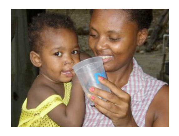
Drinking water treated with PUR (P&G, G. Allgood)